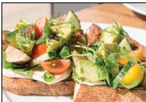
From The Dearborn.

And The Dearborn is already popular, thanks in part to its location, which is in the theater dis-