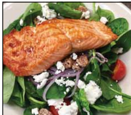
Atlantic salmon at Italian Village.

However, the 90-year tag only applies to The Village, which is on the second floor of the venue. The thing is that Italian Village is actually three restaurants in one: La Cantina (the lower-level spot that serves traditional Italian dishes, but is also more of a steakhouse) opened in