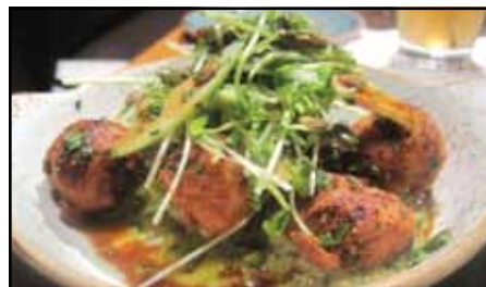
State Lake Chicago Tavern.

In a spot with warm woods and an artfully decorated bar, State and Lake offers cold appetizers like smoked trout dip (with trout, mascarpone, lemon, house hot sauce and crackers) and a succulent golden beet salad (roasted golden beets, avocado, napa cabbage, hard cider vinaigrette, hazelnuts and spices) as well as some tasty hot apps like pork meatballs and crab fat-braised pork belly, which is worth