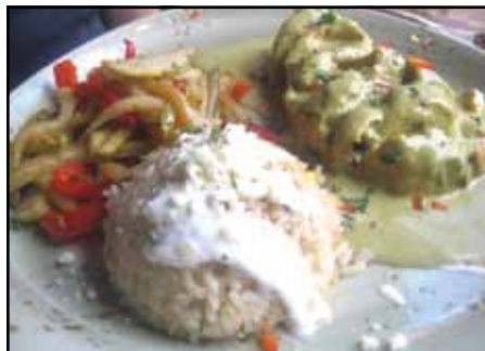
Chicken Azteca at Mago Grill & Cantina.

Mago Grill & Cantina (various locations, including 1010 S. Delano Ct., in Chicago; MagoGrill.com) falls squarely in the latter category, although it makes sure to have all the bells and whistles in place, including sugar skulls and luchador masks.