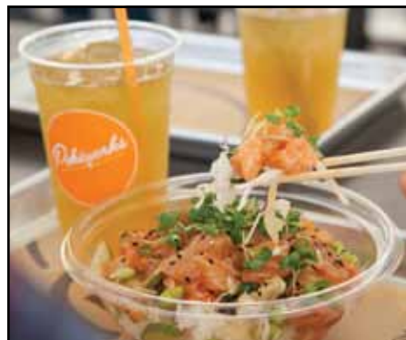
Salmon shiso at Pokeworks.

For those not in the know, poke (which originated in Hawaii) is a salad containing raw fish. My experience has been that's made primarily with tuna, although Pokeworks has expanded that concept to include salmon, chicken or even tofu—which almost sounds like an "Americanizing" of traditional Hawaiian food, even though Hawaii is part of the United States.