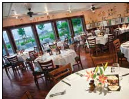
Palm Restaurant's Lakeshore Room.

And don't forget to ask about the 837 Club, which offers exclusive benefits to Palm regulars. A one-time registration of $25 earns you membership—and a $25 gift card toward your next visit. Accumulated points lead to benefits as varied as Tiffany & Co. gift cards, a Napa Valley wine tour and a private party.