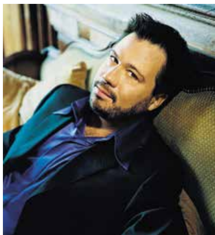
Opera star David Daniels (above) and his husband have been named in a scandal.