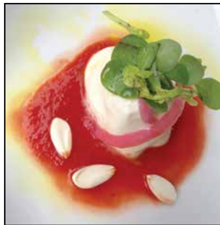
Burrata at Locanda.

Of course, Locanda has pasta dishes—and the king-crab ravioli in saffron-fennel sauce was one of the most memorable items I had eaten in