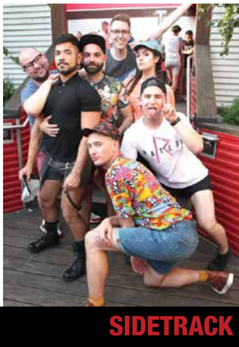
Sunday Slushies ... and what they can lead to.